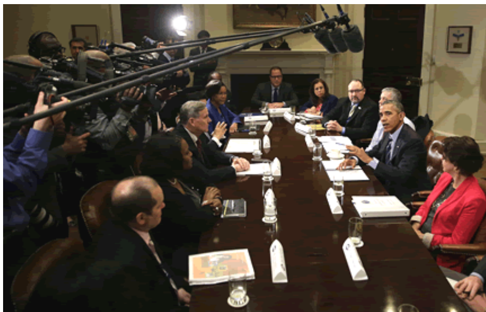
President Obama briefs the news media in his discussion with big-city school leaders.