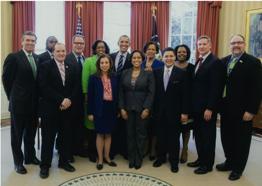
Urban school leaders pose with President Barack Obama in the Oval Office after their meeting.