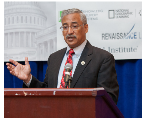
Congressman Bobby Scott

“This gap is getting worse as time draws on,” said Scott. “We must address that or the long term reality is that low-income